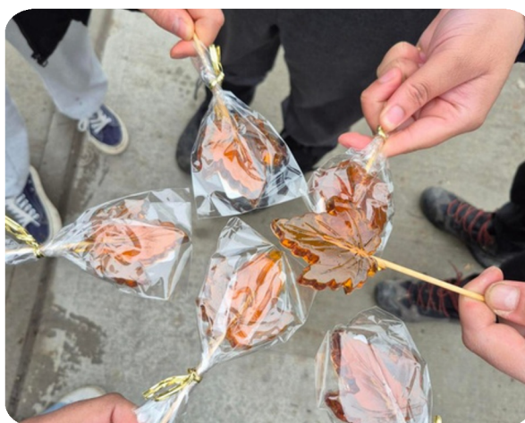
Maple Syrup Festival