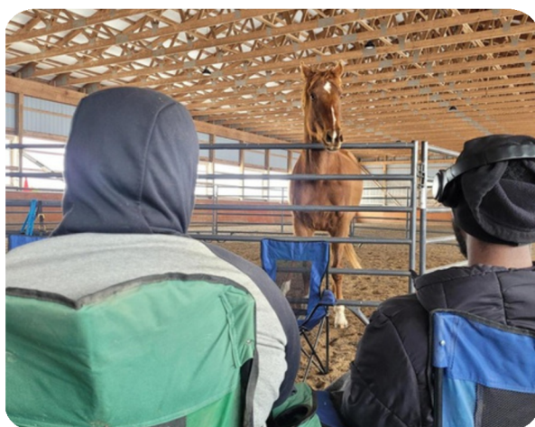
Equine Experiential Connection program

These moments go beyond activities – they help youth build confidence, discover new passions, and feel a sense of belonging. We're so grateful to our community partners who help make these opportunities possible. We're so excited to explore our community this Spring!