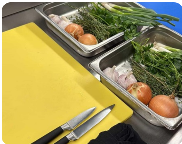
Lessons in the YWS kitchen