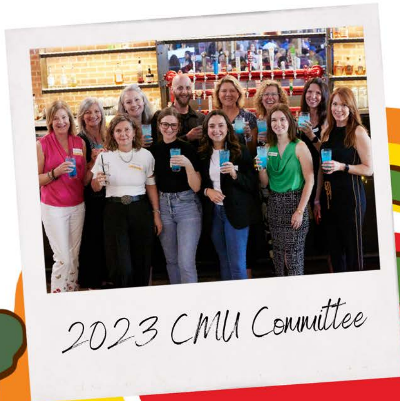
2023 CMU Committee

We would also like to say a special thank you to our dedicated Development Committee who volunteered their time to create Cover Me Urban from the ground up. Although CMU is a YWS event, it is truly these incredible committee members who donate their time and expertise to create an opportunity for our community to come together to raise funds and awareness. Without this team of individuals, CMU would simply not exist. So, from the bottom of our hearts, thank you for your devotion, your commitment to the cause, and your support of our youth. Your dedication is truly inspirational.